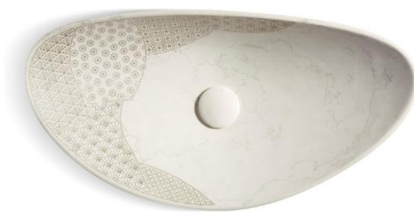
Oval Trough Vessel in Biancone* K-8324-CS7