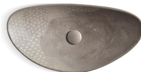
Oval Trough Vessel in Grey Foussana* K-38225-CS7