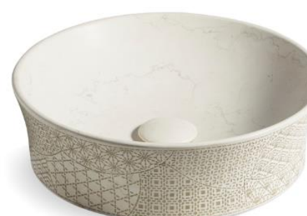
Round Vessel in Biancone* K-8324-CS6