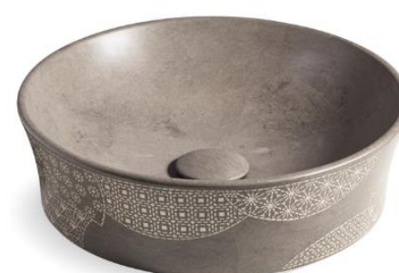
Round Vessel in Grey Foussana* K-8324-CS7