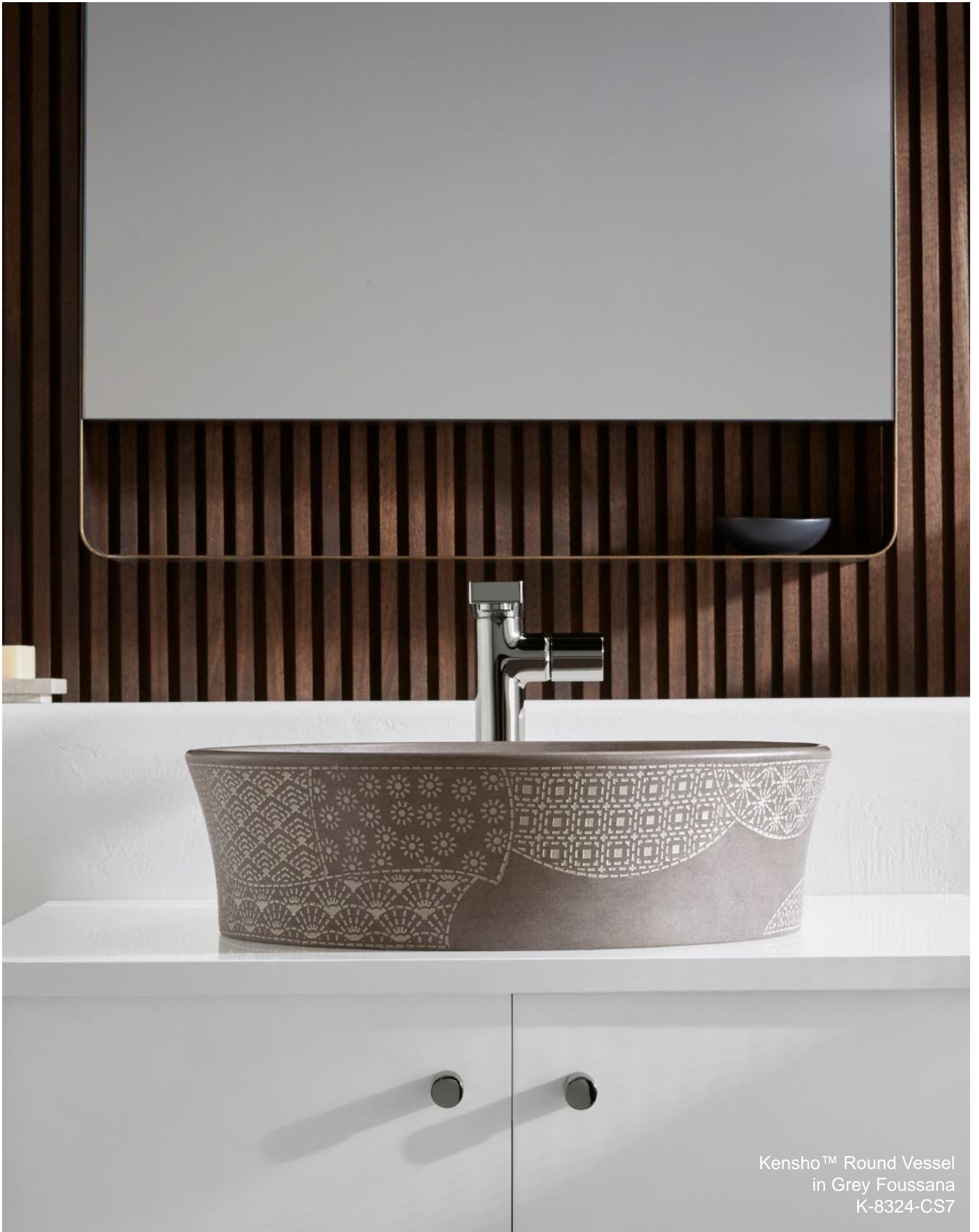
Kensho™ Round Vessel in Grey Foussana K-8324-CS7